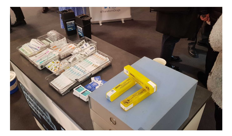
Mock Drug Consumption Room

The South West has the highest prevalence of illicit drug use in the UK. An aging cohort of heroin and crack users are of particular concern to health and support agencies. Injecting drug use leads to an array of physical health issues, and NSPs in combination with OST is an effective strategy to reduce the related harms and encourage cessation of drug use. Among young people, Cannabis, cocaine, MDMA and ketamine are the most commonly used drugs - with many purchasing their substances on social media. It appears that Year 9 may offer a critical intervention opportunity to improve drugs education and patterns of use among young people. More broadly, funding is desperately needed for treatment agencies and focus needs to be placed upon multi-agency partnership working. The police are in a unique position to help move drug policy reform forward, and could be instrumental in any future Safer Injection Facilities or Heroin-Assisted Treatment programmes. Given how prevalent drug use is across the South West, it is not given anywhere near enough attention or funding by local authorities or educational institutions.